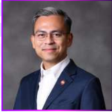
KEYNOTE ADDRESS BY YB DATUK FAHMI FADZIL Minister of Communications, MALAYSIA